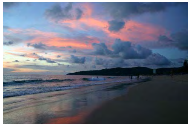
Sunset over Karon Beach

For more photos see the 'Photo' page of the Tournament Website www.phuketsixes.com