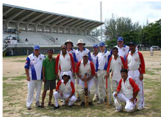
Waratah's (Australia) and Guwahati Town (India)