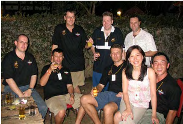
Enjoying the Welcome Reception Party