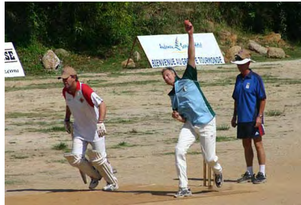
England International Alan Mullally in action