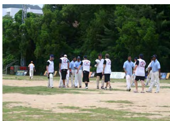
Post Match Handshakes