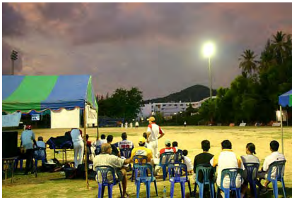
Floodlit cricket scene from the Twenty20 match