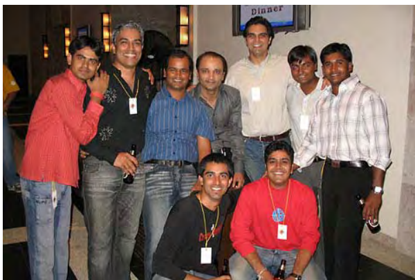
Enjoying the Awards Dinner