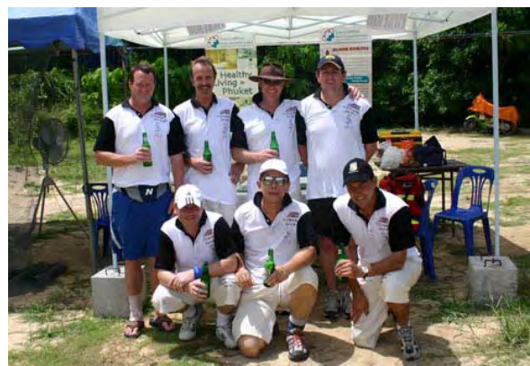
Enjoying a post match beer!