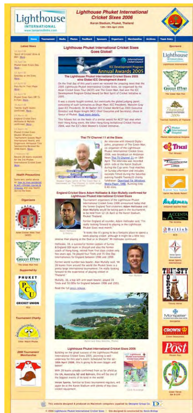
Tournament Website Screenshot

Lighthouse International, tournament logo, The Green Man, TAT, Phuket International Hospital, Thai International Airways, Travelscene Lords, Karon Sea Sands Hotel, Andaman Hotel, Accenta, BCIS, Imran Sports International, Thirsty Horse, Montpellier, Crown Relocations, Phuket Post, Green Parrot, Phuket Cricket Union, Childwatch Charity.