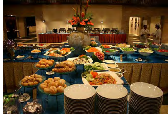
Awards Dinner spread at the Hilton Arcadia