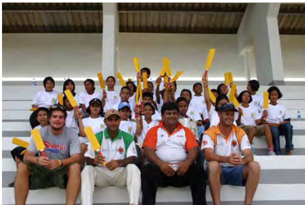
Kids from the PCU Development program