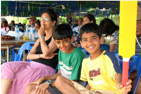
Spectators enjoying the tournament