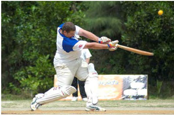
Another big six on the way!