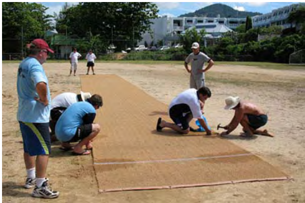
Preparing the pitch each morning