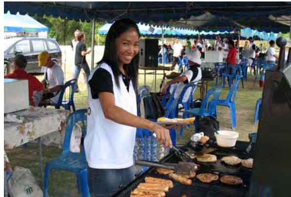
Keeping everyone well fed!