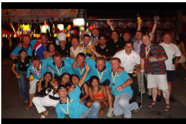
Great spirits in Soi Bangla, Phuket