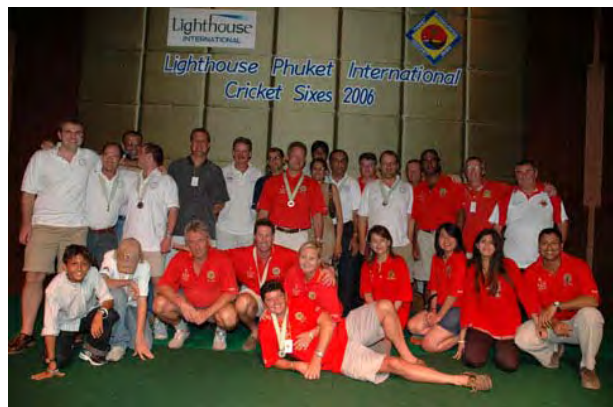
Several teams on stage at the Awards Dinner