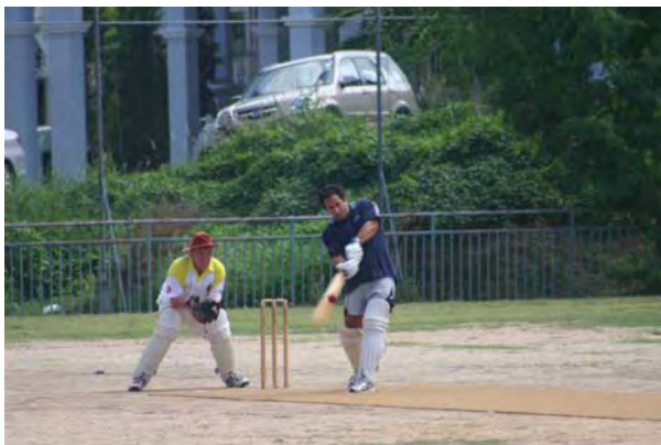
Adam Hollioake in action